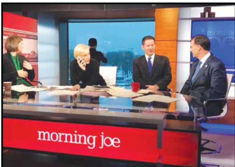
Congressman Suozzi (far right) Before his "Morning Joe" Appearance

In a nationally televised appearance on MSNBC's "Morning Joe," Congressman Tom Suozzi (D -- Queens, Long Island) pushed back strongly against the Republican-led health care plan, saying that