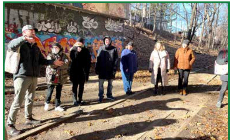
Congresswoman Meng recently touring the QueensWay Project

The Forest Park Pass includes over 9 acres and extends about 0.65 miles from Union Turnpike, through Forest Park, to Park Lane South. The full QueensWay project will be a 3.5-mile, 47-acre linear park that transforms a stretch of abandoned railway to into green space, as well as a transportation corridor featuring pedestrian and bike-friendly paths that connect six