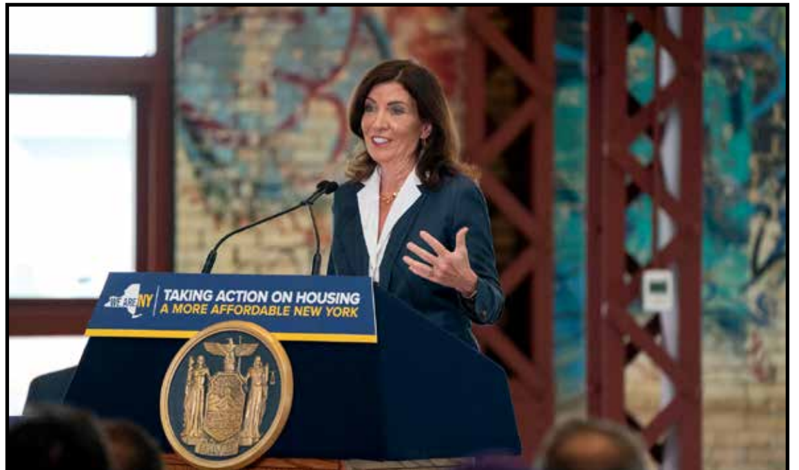
Governor Kathy Hochul's takes Executive Actions to promote housing growth across New York. See story on page 2.