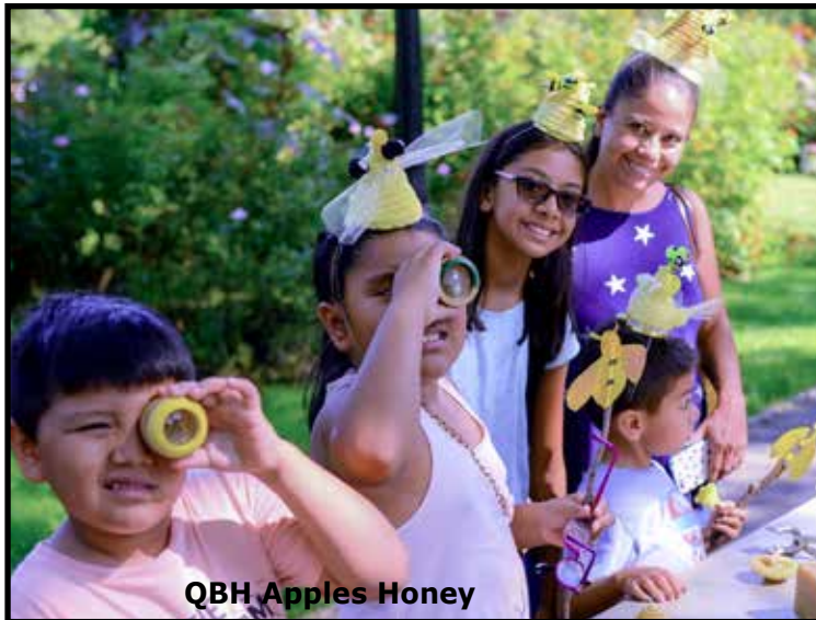
QBH Apples Honey

Sept. 8, Queens County Fair, Sept. 10. This 40th annual agricultural fair features pie-eating and corn-husking contests, hayrides, carnival rides, games, crafts, food, entertainment, and surprises. Schedule: 6 pm to 9 pm on Sept. 8; and 11 am to 6 pm on Sept. 9 and 10. Queens County Farm Museum, 73-50 Little Neck Pkwy., Glen Oaks.