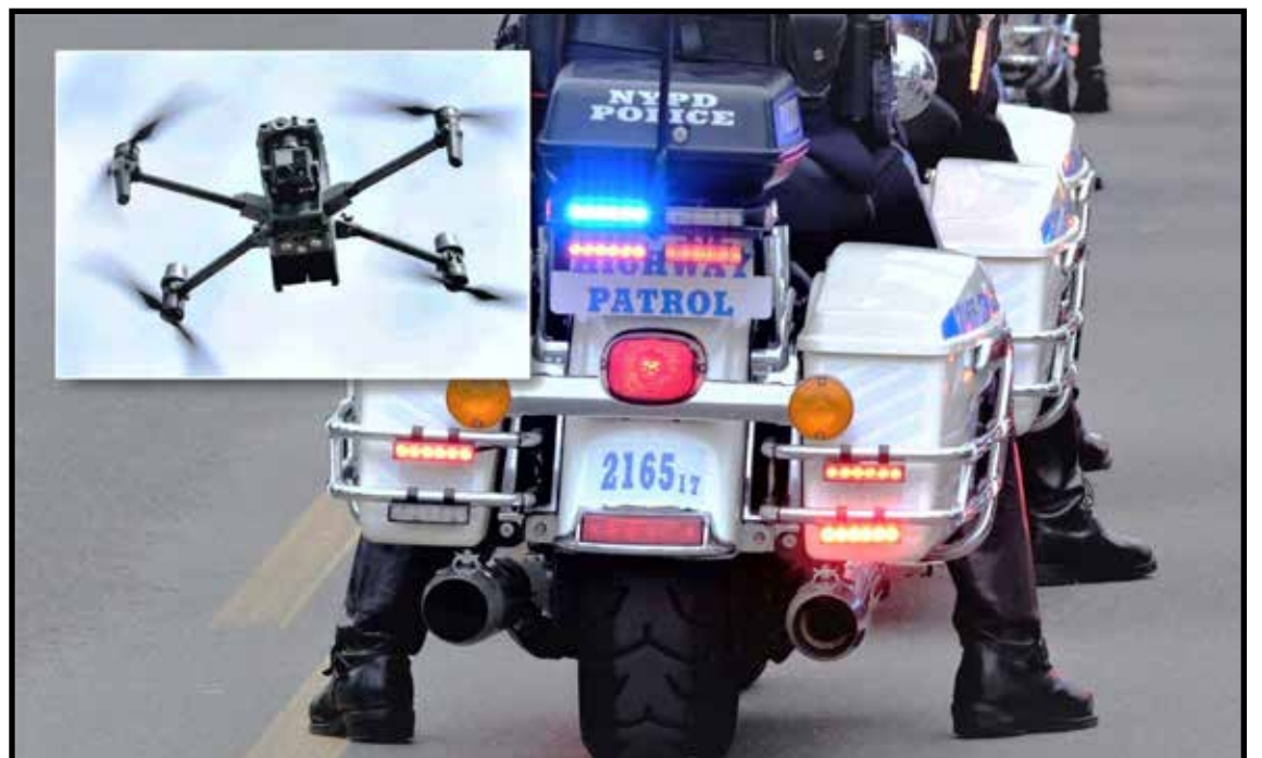
Mayor Adams has floated the idea of letting the NYPD use 'motorcycles and drones together' in responding to crime scenes. See story on page 2.

One Edition for ALL of Queens! Visit our website at www.queentimes.com