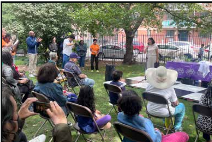
Congresswoman Meng over the weekend at the 175th birthday celebration of Lewis Latimer which took place at the Lewis Latimer House Museum in Flushing.

Lewis Latimer, an inventor and electrical pioneer, lived in Flushing in the early 1900s and his house now serves as a museum in the area dedicated to his legacy