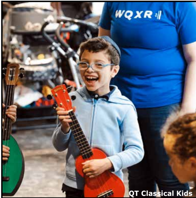
QT Classical Kids