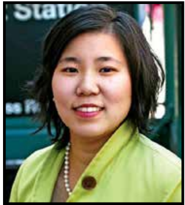
One of Commission's members is a Queens resident who was appointed to the agency earlier this year

Report examines the federal government's role in documenting, prosecuting and preventing hate crimes against those of Asian descent during the COVID-19 pandemic