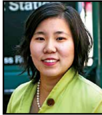
The NYPD Hate Crimes Unit is investigating the assault

U.S. Rep. Grace Meng (D-NY) issued the following statement on the attack of a Queens Sikh