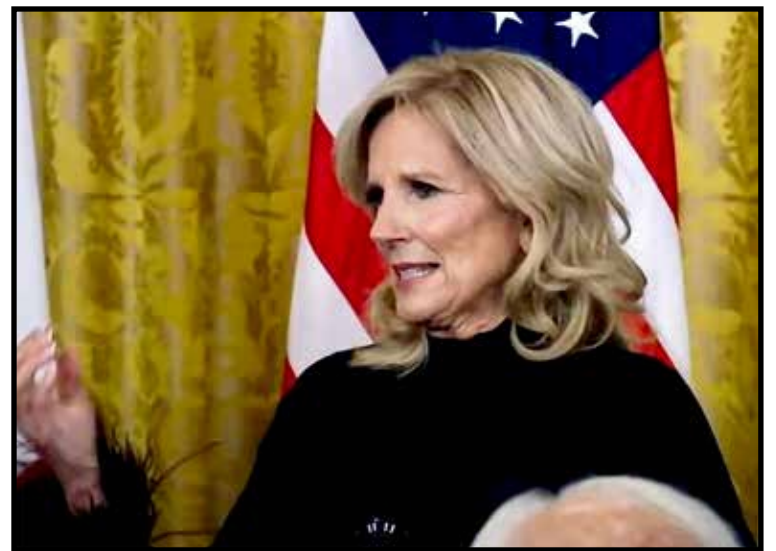
First Lady Jill Biden hosted a delegation of leaders from the Italian American community