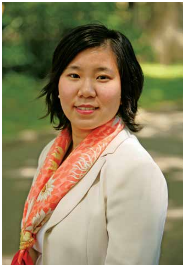
Congresswoman GRACE MENG

Paid For and Authorized by Grace For New York